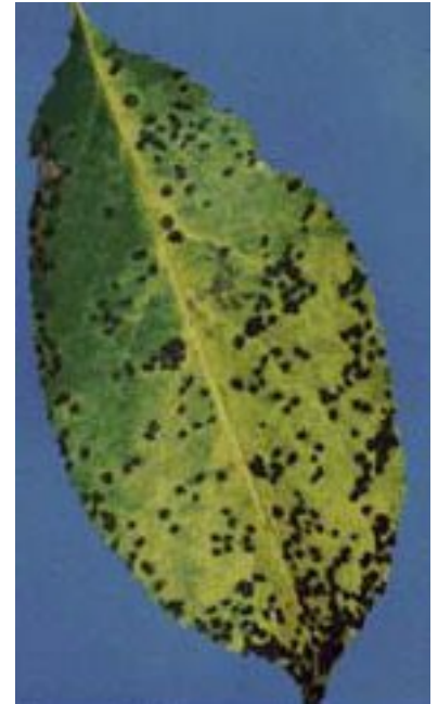
Cherry leaf spot symptoms on upper surface of cherry leaf.

Cherry leaf spot is caused by the fungus, Blumeriella jaapii (previously called Coccomyces hiemalis ). The fungus overwinters in dead leaves on the ground. In early spring (about petal fall), fungal fruiting bodies called apothecia develop in these leaves. Spores (ascospores) are produced in the apothecia and are forcibly discharged during rainy periods for about six to eight weeks, starting at petal fall. The optimal temperatures for ascospore discharge are 61 degrees F (16 degrees C) and higher. Very few ascospores are discharged at temperatures below 46 degrees F (8 degrees C). These ascospores are spread by wind or splashing rain drops to the green, healthy leaves and serve as primary inoculum for disease. The ascospores stick to the leaf surface, germinate in a film of water, and within several hours at the proper temperature, penetrate the leaf through stomata (natural openings) on the underside of the leaf. The small purple spots soon appear on the upper surface. Incubation time, from fungus penetration to the appearance of the spots varies with temperature. Under damp conditions and with temperatures between 60 and 68 degrees F (15-20 degrees C), the period may be as short as five days. When rain and dews are absent and at lower temperatures, as long as 15 days may be required before symptoms appear.