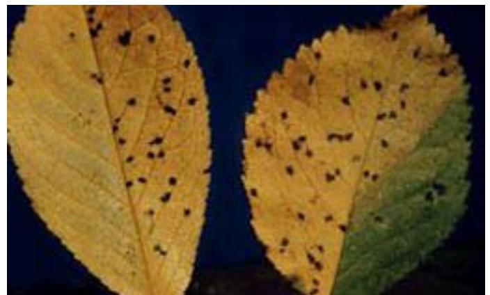
Infected leaves usually turn yellow or gold before they drop prematurely.