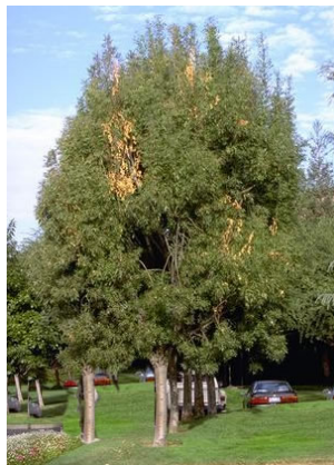
Clearwing borer damage on ash tree

Information obtained through the University of California