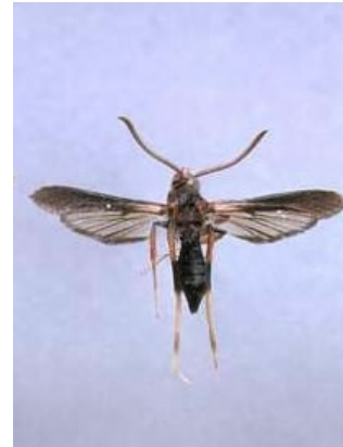
Adult Male Clearwing Ash Borer

The larvae of several species of clearwing moths in the insect family Sesiidae are important wood-boring pests in landscapes. Hosts include alder, ash, birch, fir, oak, pine, poplar, sycamore, willow, and stone fruit trees such as apricot, cherry, peach, and plum. Larvae that closely resemble those of clearwing moths include the American plum borer a serious boring pest of hosts that include fruit and nut trees, mountain ash, olive, and sycamore. Other common wood-boring pests in landscapes include bark beetles.