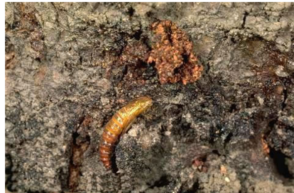
Peachtree Borer pupa with "frass"

Clearwing moth adults have long, narrow front wings and shorter, wider hind wings. The hind wings, and in some species the front wings, are mostly clear. These moths fly during the day or at twilight, and their yellow and black coloring resembles that of paper wasps or yellowjackets. Adults display wasplike behavior by intermittently running while rapidly fluttering their wings. They differ in color depending on species and sex. They are often yellow, orange, or red on black or dark blue.