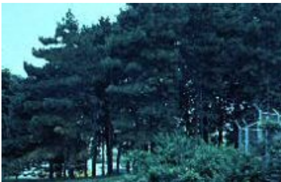
The lower left portion of this pine is diseased with tip blight. It often begins on lower branches.