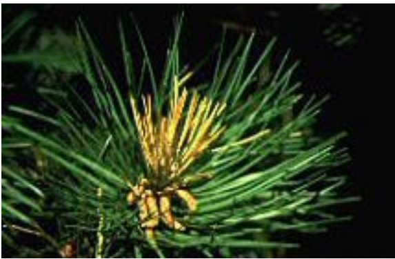
Close-up of pine needles with tip blight.

3. Do not shear or prune infected trees during wet weather because spores released at this time may be carried from tree to tree on pruning tools.