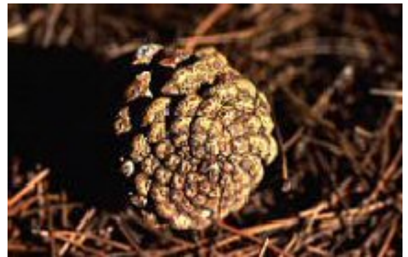
Fungal fruiting bodies on pine cones.

4. This disease can be partially controlled with fungicides. Attention must be given to protecting the new spring growth of the trees from bud swell to full candle elongation. Make first application just prior to bud break and make two