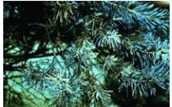
This Scots pine shoot has been killed following infection by the tip blight pathogen.

Other problems can cause similar dieback and tree decline. Winter drying; drought; injury from weevils, pine-shoot moths or tip moths; and some needle cast diseases caused by other fungi may cause damage similar to tip blight.