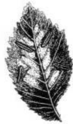
Larvae on elm leaf

Apply in early spring when eggs are hatching, new larvae are appearing and leaf skeletonizing is first observed on fully expanded leaves usually in late May. A second spray may be needed in July for second generation larvae. Carefully inspect the undersides of the leaf for small, black larvae and spray only if found in large numbers with leaf skeletonization. Only the trunk of the tree needs to be sprayed when larvae are near the tree base and prior to pupation.