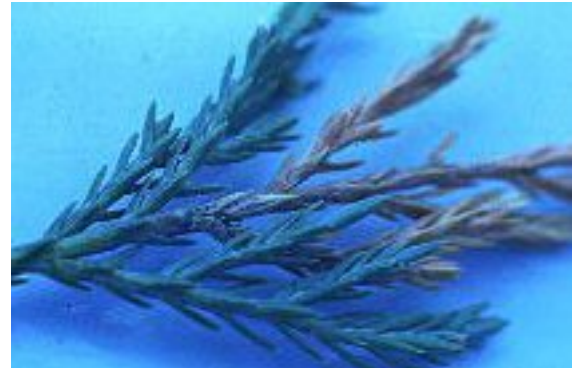
Close-up of Phomopsis tip blight on juniper.

Phomopsis tip blight and Kabatina tip blight are two common diseases of junipers found in most states east of the Mississippi. Both diseases are caused by fungi and the damage they cause on nursery stock, transplants and certain juniper varieties in the landscape can be severe; however, most established junipers in the landscape are seldom killed. The disease is most serious on younger plants and becomes less serious as plants get older. There are many varieties of juniper that vary from very susceptible to highly resistant. Junipers are generally considered as low maintenance because they are relatively free of major diseases and insect pests; however, these diseases can adversely affect the appearance and health of these trees in certain locations and under the proper environmental conditions. Although Phomopsis and Kabatina blights cause almost identical symptoms, aspects of their development and control do differ. Therefore, it is important to distinguish between the two diseases.