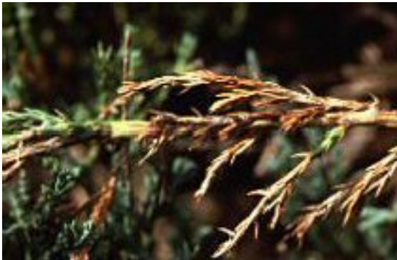
Close-up of Phomopsis tip blight on juniper.