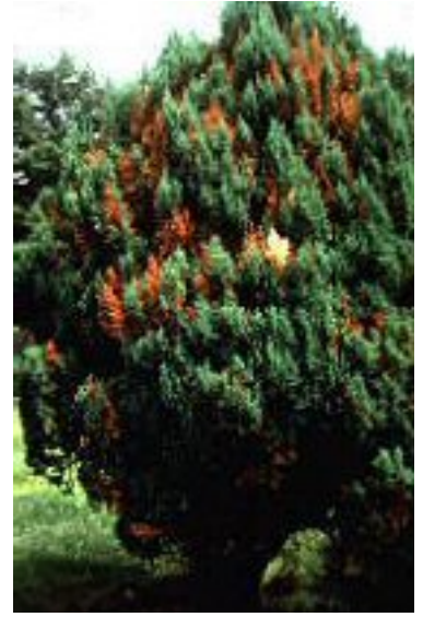
Appearance of Phomopsis tip blight on juniper.

Information obtained through the Ohio State Extension Factsheet HYG-3056-96