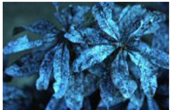
Powdery mildew on azalea leaves.