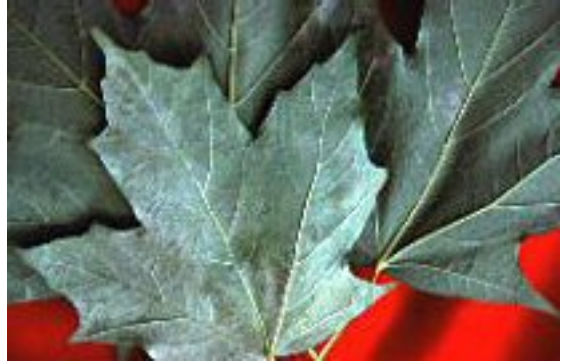
Powdery mildew on maple leaves.

Most powdery mildew fungi produce airborne spores and infect plants when temperatures are moderate (60 to 80 degrees F) and will not be present during the hottest days of the summer. Unlike most other fungi that infect plants, powdery mildew fungi do not require free water on the plant surface in order to germinate and infect. Some powdery mildew fungi, especially those on rose, apple, and cherry are favored by high humidity's. Overcrowding and shading will keep plants cool and promote higher humidity. These conditions are highly conducive to powdery mildew development.