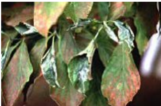
Powdery mildew on dogwood leaves. Note the distortion on affected leaves.

Powdery mildew fungi infect almost all ornamental plants. They are commonly seen only on those plants more naturally susceptible to the disease. Susceptible woody plants include some deciduous azaleas, buckeye, catalpa, cherry; a few of the flowering crabapples, dogwood, English oaks, euonymus, honeysuckle, horse chestnut, lilac, privet, roses, serviceberry, silver maple, sycamore, tulip tree, some Viburnums, walnut, willow and wintercreeper. Powdery mildews are also common on certain herbaceous plants, such as chrysanthemums, dahlias, delphiniums, kalanchoes, phlox, Reiger begonias, snapdragons and zinnias. Remember that each species of powdery mildew has a very limited host range. Infection of one plant type does not necessarily mean that others are threatened. For example, the fungus that causes powdery mildew on lilac does not spread to roses and vice versa.