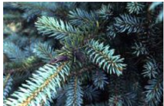
Figure 3. Purple needles of spruce infected with Rhizosphaera.