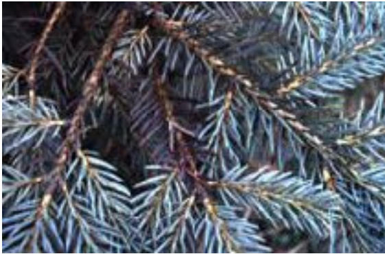
Figure 4. Defoliation of spruce caused by Rhizosphaera.

At planting time, the foliage of blue spruce should be examined for fruiting bodies of Rhizosphaera protruding through needle stomata. If these bodies are present, the tree should not be planted.