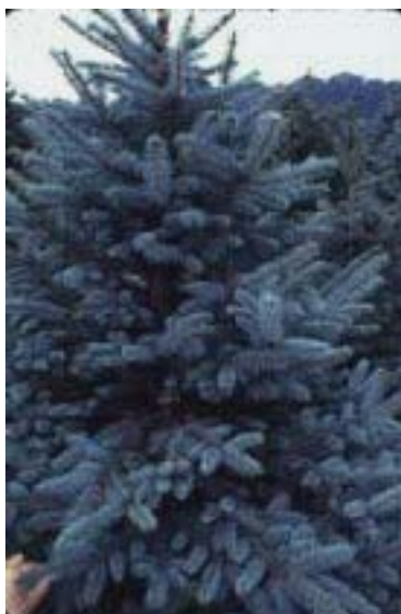
Figure 2. Purple needles in the interior of a spruce infected with Rhizosphaera.

Although needles on new growth become infected in May and June, symptoms are not visible until late fall or the following spring, when infected needles turn purple to brown and begin to drop (Figures 2, 3, and 4). Tiny fruiting bodies of the Rhizosphaera fungus protrude through the stomata of the infected needles. Under a hand lens, these stomata appear as fuzzy black spots instead of their usual healthy white color (Figure 5). During wet weather in late spring, spores are released from these fruiting bodies and are rain splashed onto newly developing needles where infection occurs and the disease cycle is repeated.