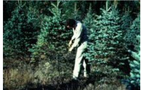
Figure 1. Lower needles of blue spruce showing symptoms of needlecast.

A healthy spruce will retain its needles 5 to 7 years. A spruce severely infected with Rhizosphaera needlecast may hold only the current year's needles. Rhizosphaera needlecast infects needles on the lower branches first and gradually progresses up the tree (Figure 1). This pattern holds true for most needle diseases on conifers and is the result of more favorable conditions for disease development near the ground. Under epidemic conditions, lower branches may be killed by this fungus.