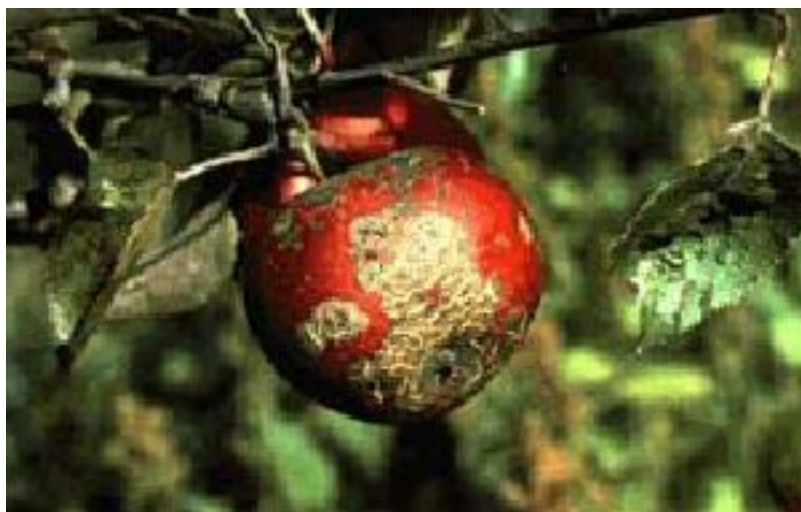
Apple scab lesions on fruit.