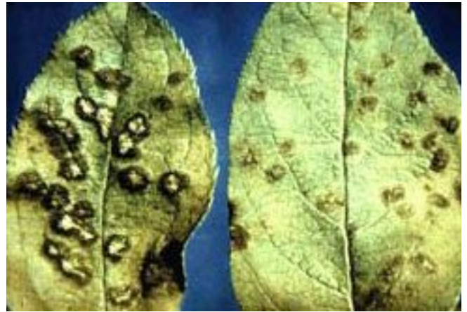
Apple scab lesions on apple leaves.

Symptoms first appear in the spring as spots (lesions) on the lower leaf surface, the side first exposed to fungal spores as buds open. At first, the lesions are usually small, velvety, olive green in color, and have unclear margins. On some crabapples, infections may be reddish in color. As they age, the infections become darker and more distinct in outline. Lesions may appear more numerous closer to the mid-vein of the leaf, if heavily infected the leaf becomes distorted and drops early in the summer. Trees of highly susceptible varieties may be severely defoliated by mid to late summer.