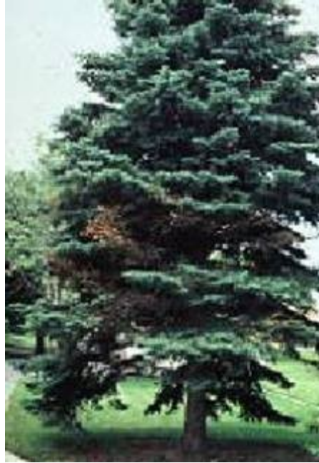
Cytospora canker occurring on lower branches of blue spruce tree.