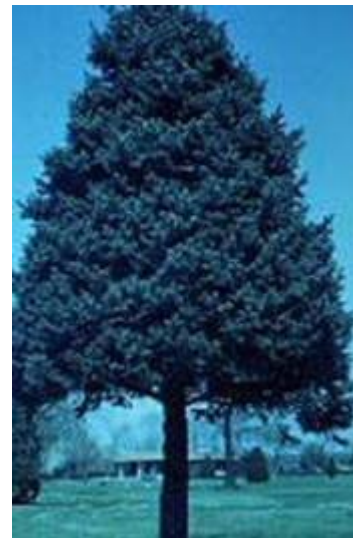
Effects of Cytospora canker on spruce tree. Lower limbs removed.

Prune and remove or destroy affected branches. To lessen the spread of thy fungus, prune only when the trees are dry. Pruning tools should be disinfested with 70% alcohol between cuts. It will generally be necessary to prune back to the main trunk. No effective chemical control measures are available.