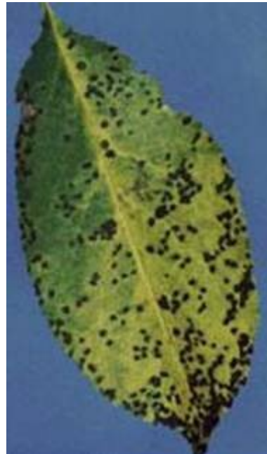
Cherry leaf spot symptoms on upper surface of cherry leaf.

Spots similar to those on the leaves may also form on leaf petioles and fruit pedicels, causing fruit to ripen unevenly. Spots usually do not form on fruit.