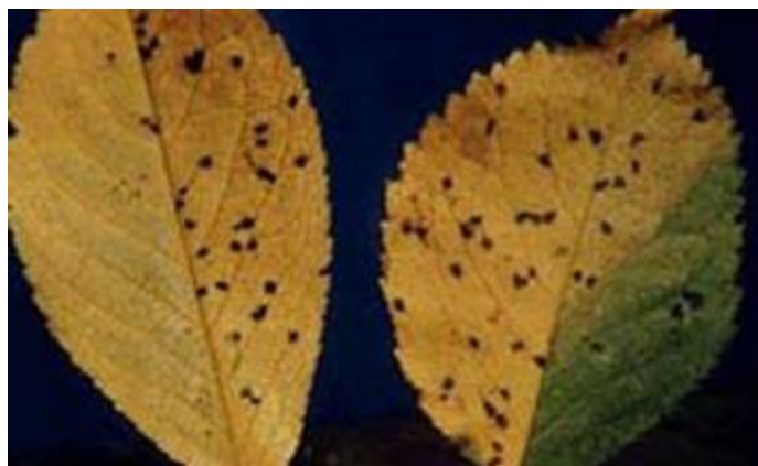
Infected leaves usually turn yellow or gold before they drop prematurely.

Cherry leaf spot is caused by the fungus, Blumeriella jaapii (previously called Coccomyces hiemalis ). The fungus over winters in dead leaves on the ground. In early spring (about petal fall), fungal fruiting bodies called apothecia develop in these leaves. Spores (ascospores) are produced in the apothecia and are forcibly discharged during rainy periods for about six to eight weeks, starting at petal fall. The optimal temperatures for ascospore discharge are 61 degrees F (16 degrees C) and higher. Very few ascospores are discharged at temperatures below 46 degrees F (8 degrees C). These ascospores are spread by wind or splashing rain drops to the green, healthy leaves and serve as primary inoculum for disease. The ascospores stick to the leaf surface, germinate in a film of water, and within several hours at the proper temperature penetrate the leaf through stomata (natural openings) on the underside of the leaf. The small purple spots soon appear on the upper surface. Incubation time, from fungus penetration to the appearance of the spots varies with temperature. Under damp conditions and with temperatures between 60 and 68 degrees F (15-20 degrees C), the period may be as short as five days. When rain and dews are absent and at lower temperatures, as long as 15 days may be required before symptoms appear.